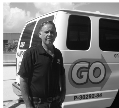
Driving Record of Shuttle Bus Operator Under Constant Review

Servers of alcohol in Ohio have to follow serving guidelines and can be held liable for injuries. Many of our restaurant and tavern customers carry "liquor liability insurance."