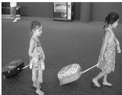
Homeowners Insurance Follows You Around the World.

Our family headed to Miami for a cruise to celebrate my dad's 80th birthday. Our grandchildren made sure they packed for the occasion. We pay claims for personal items that are lost or stolen anywhere in the world.