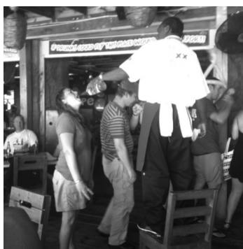
Servers of Alcohol Need Special Insurance

There were 32 family members on the trip. There haven't been that many Guarascis on one boat since the whole clan sailed over from Italy in 1919.